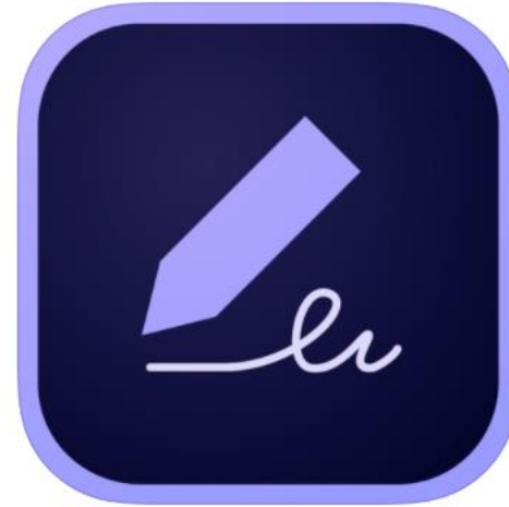
Adobe Fill & Sign— Form Filler