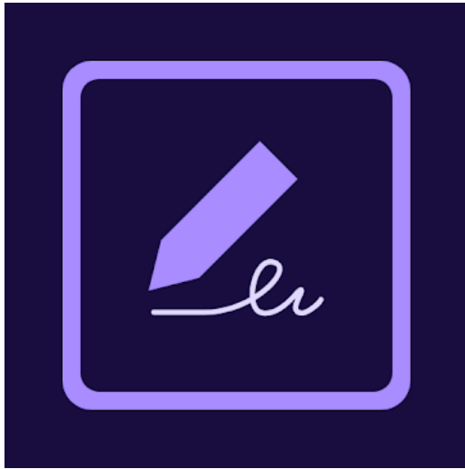
Adobe Fill & Sign: Easy PDF Form Filler